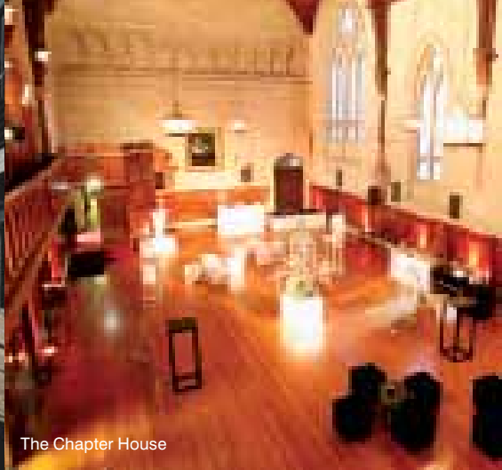
The Chapter House