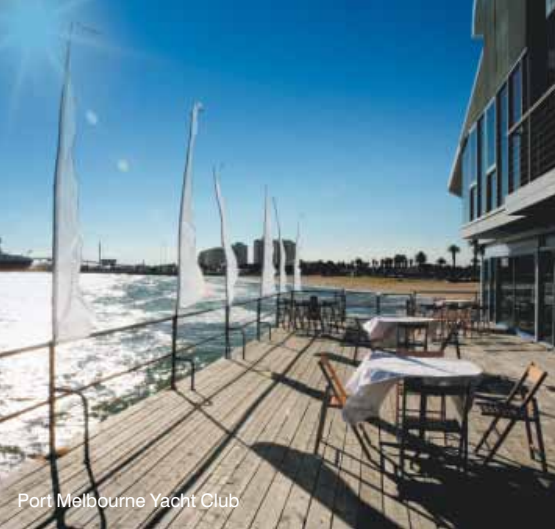
Port Melbourne Yacht Club